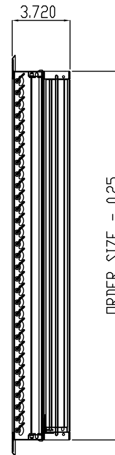
SECTION A-A SCALE 1 : 3