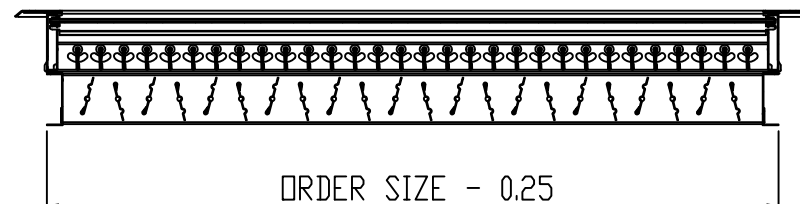
SECTION B-B SCALE 1 : 3